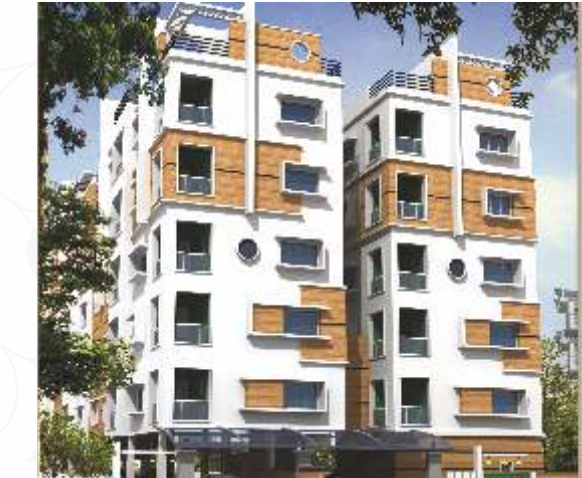
Jains PCH Elite, P.G. Road, Secunderabad.