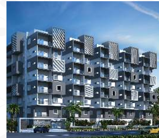
Jains Ravi-Gayathri Heights, Shilparamam.