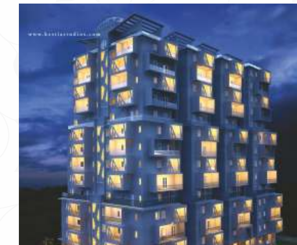
Jains Sadguru Heights, Madinaguda.