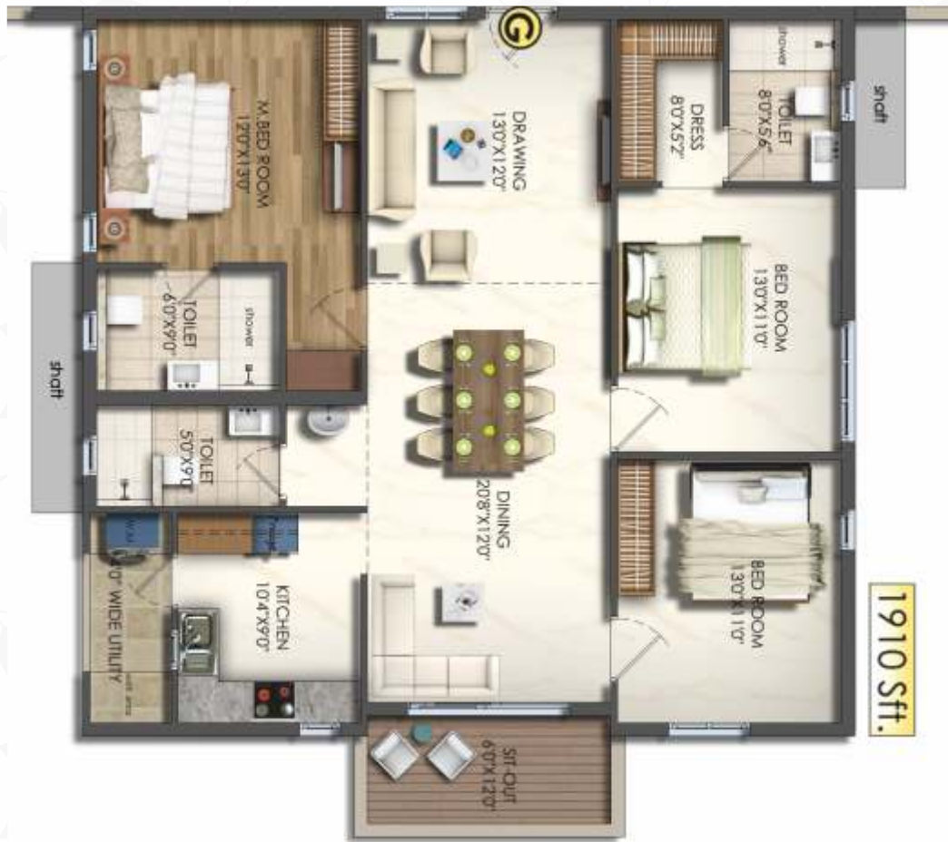
(BLOCK-A) FLOOR PLAN