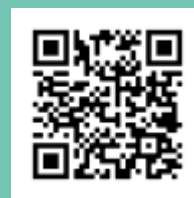
OUR WEBSITE QR CODE