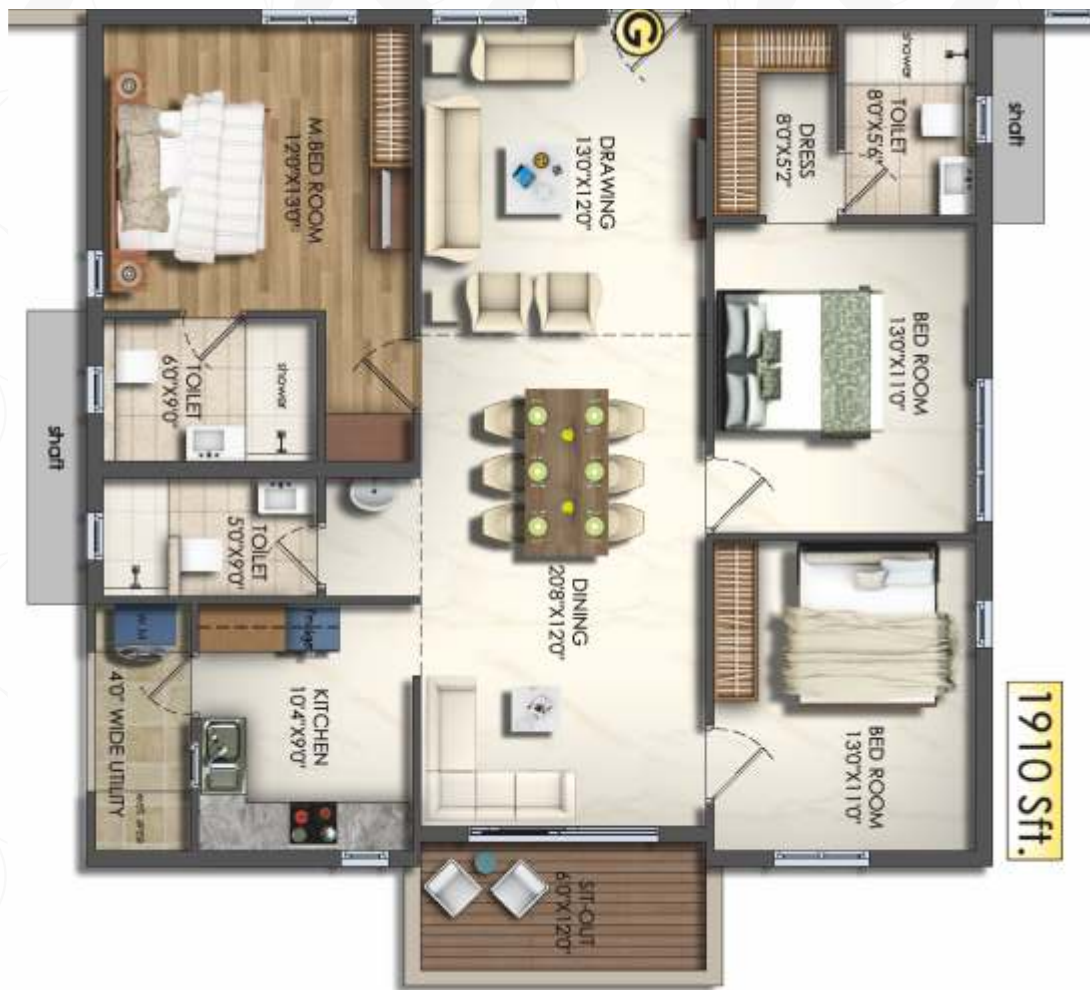
(BLOCK-B) FLOOR PLAN