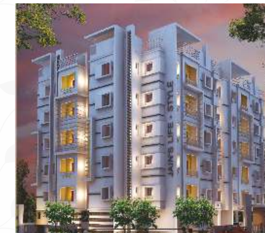
Jains PCH Lifestyle, Begumpet.