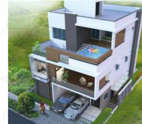
Jains Four Seasons, Kokapet.